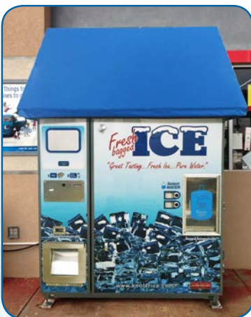
IM600XL Machine with Water Vending Station.