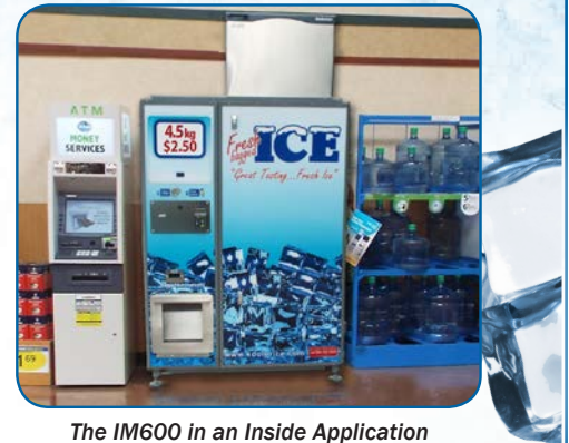
The IM600 in an Inside Application

Credit Card Only – For businesses that do not want their employees to have access to or responsibility for monies in the machine, the Credit Card Only option limits the form of payment for the ice to Credit Cards, similar to the Red Box® video kiosks.