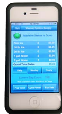
Our Remote Access Monitoring System as seen on an iPhone.

Cashless Vending Technology: It is well known that customers are using credit and debit cards to make their purchases. It's about convenience! Numerous studies have shown that adding the option of the Credit/Debit Card Reader allows owners to raise pricing with better consumer tolerance, to win new business, and to increase overall sales.