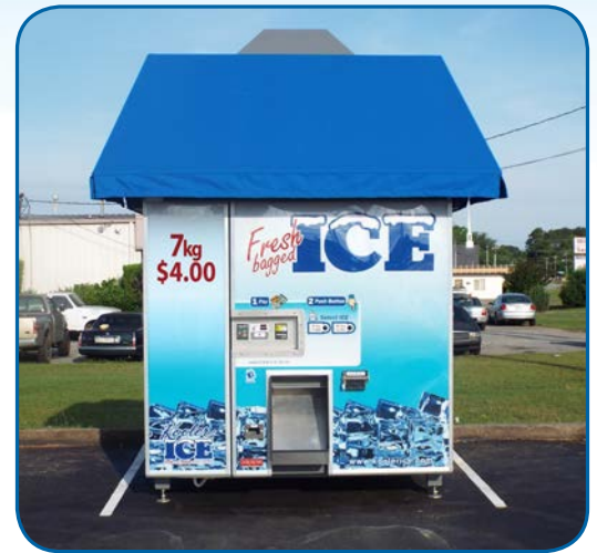
The IM2500 Series II has the highest production with the smallest footprint available in the industry today.

All of our machines comply with the new ADA requirements for consumer accessibility and, additionally, are NAMA certified and listed as complying with the federal guidelines for sanitation and consumer safety. Our machines are also ETL certified to UL541 standards for refrigerated vending machines to provide added safety for the owner and the consumer. And because the IM2500 Series II is considered a vending machine and has these important certifications, it is much easier to permit than a modular house that is considered a permanent structure.