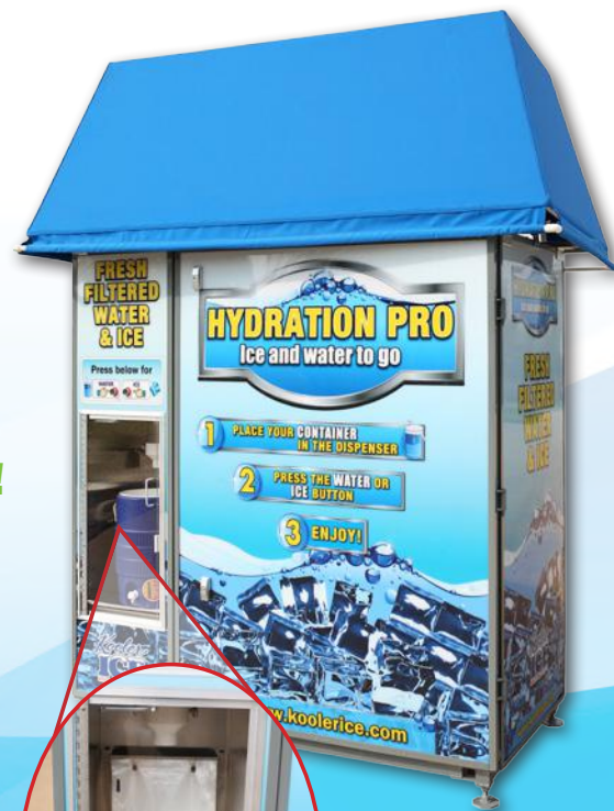
With Automatic Bagging Attachment

People spend billions of dollars on bottled water when perfectly good drinking water is readily available! Not only are we needlessly spending money on bottled water that is not even as regulated as our own tap water, but we are filling our landfills with billions of tonnes of oil based plastic products that take thousands of years to degrade. The Hydration Pro eliminates the need for buying bottled water, it encourages the use of refillable, personal containers and reduces waste disposal costs while promoting a "Green" culture within your organization.